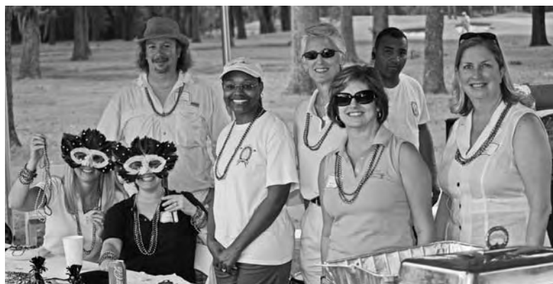
The Cajun Mardi Gras Party Hole