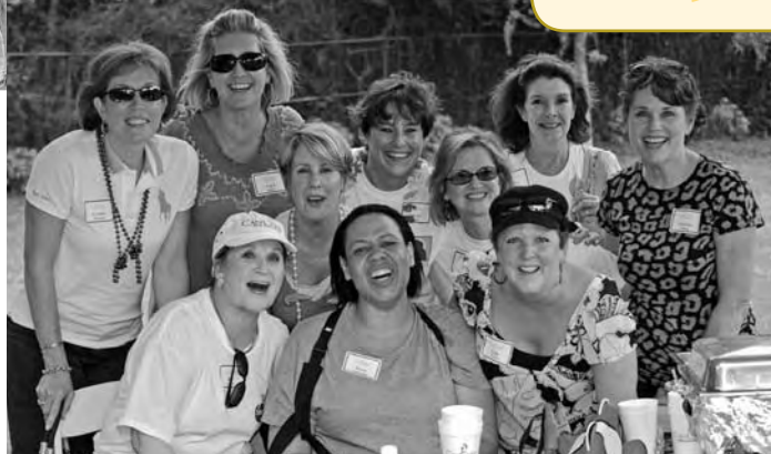
The ladies that make it happen - CanCare's Friends of CanCare Board and friends

Tuesday, December 1 CanCare Holiday Party and "Hog For Hope" Raffle Drawing