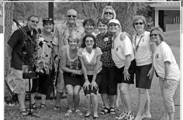
The Fishette's and "best fried fish in the world" Party Hole