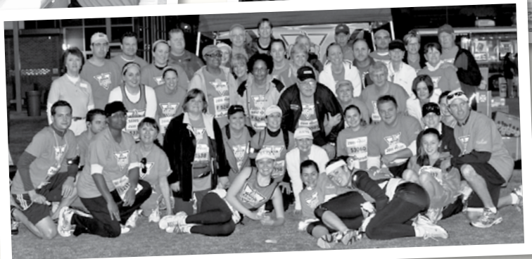
Team CanCare 5K Group